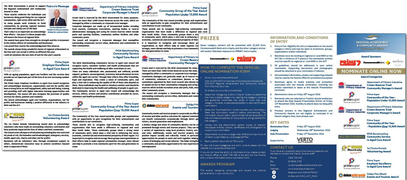
2016 Nomination Brochure