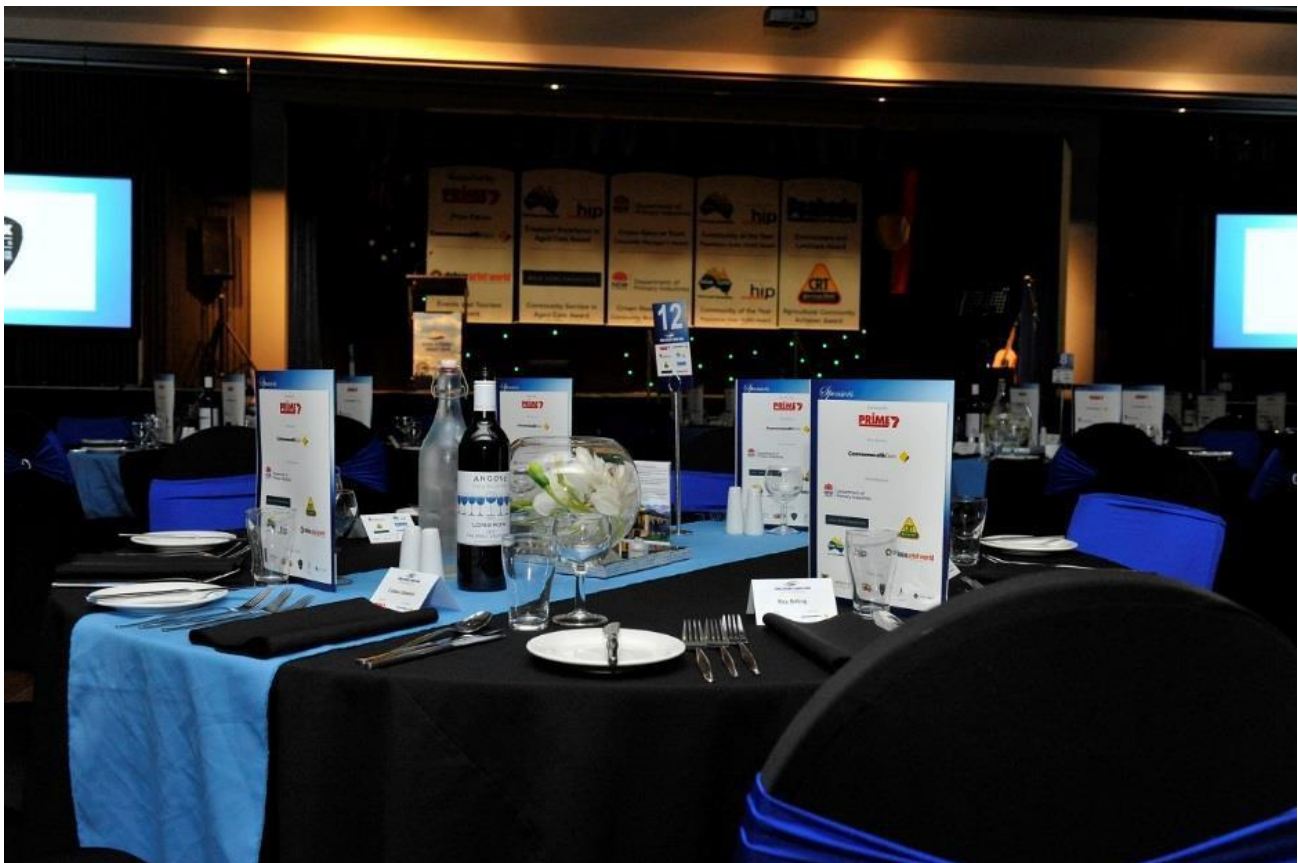
Table setting at the Gala Presentation Dinner

PRIME7 will produce a 'congratulations to winners' ad' which will be aired after the Awards Presentation Dinner for four plus weeks. Your logo will feature in the TV ad.