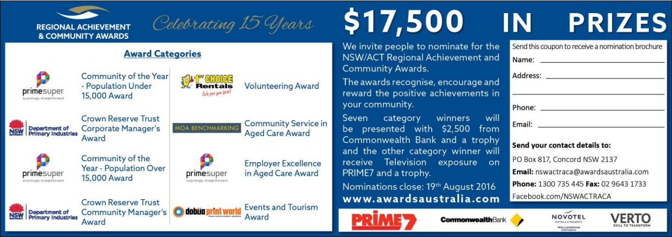
2016 Press Coupon

All local newspapers across regional and rural New South Wales and the ACT will receive the opportunity to promote the Awards through regular media releases and ads also highlighting their involvement.